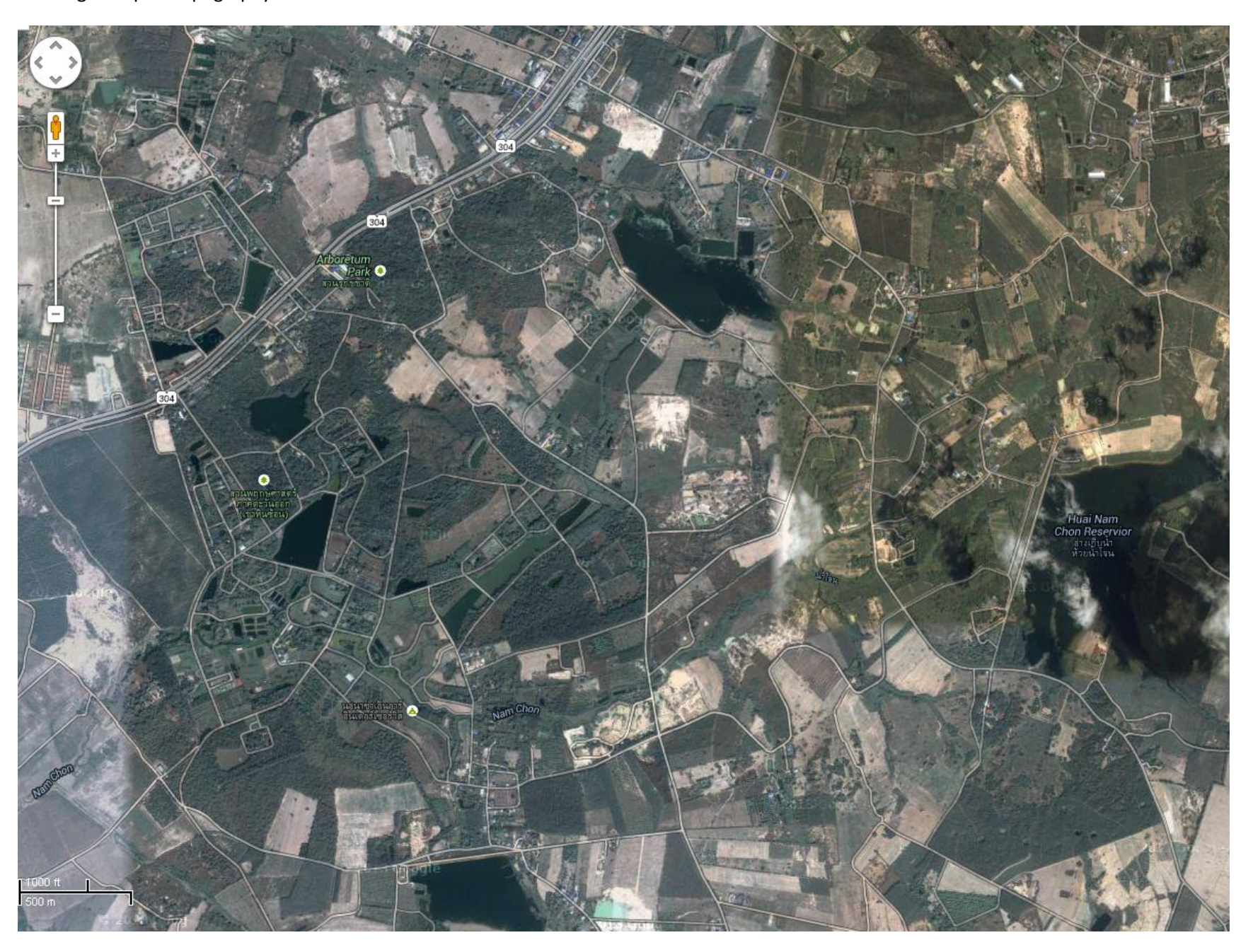
Working Group 1- Topography and Environments of Khao HinSon